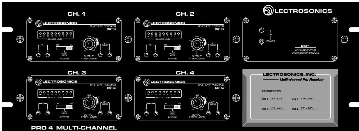
Figure 2 - PRO 4 CHANNEL Front Panel

Please refer to the manual for your particular receiver for a complete description.