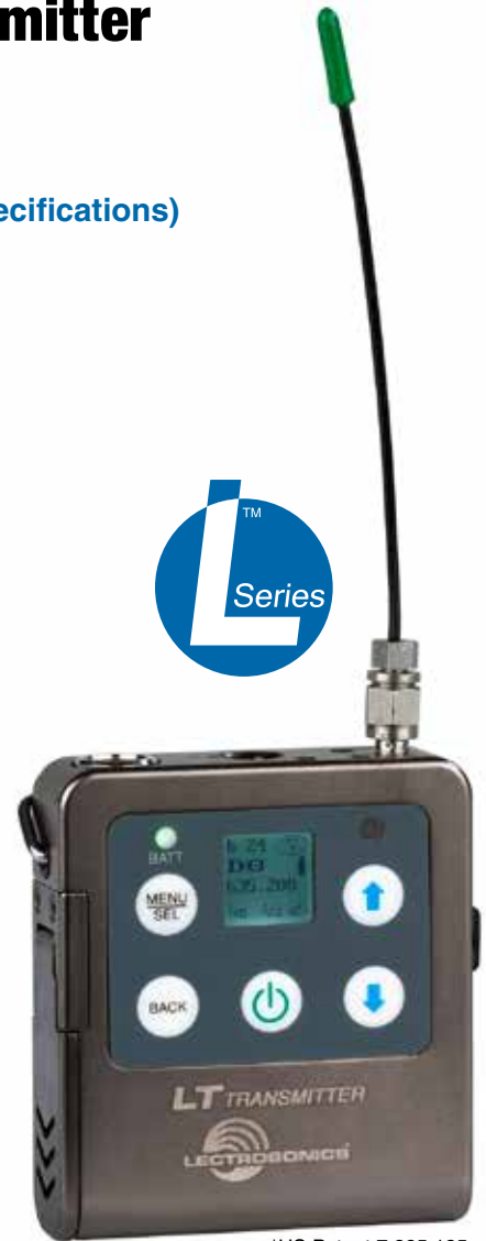
*US Patent 7,225,135

The limiter in the preamp can cleanly handle signal peaks over 30 dB above full modulation, allowing the input gain to be set high enough to achieve the maximum signal to noise ratio with no risk of overload distortion.