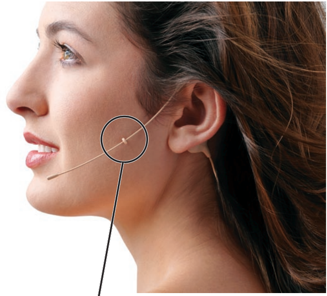
Position the drip ring at the point where the boom just leaves contact with the skin.