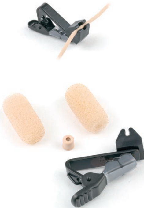
The headset is furnished with two windscreens, a cable retaining clip and a spare HF peak cap.