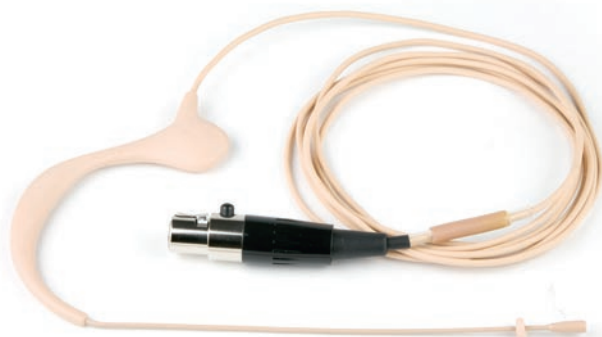
The headset is terminated with TA5F connector wired for Lectrosonics wireless transmitters

The HM172 exhibits an extended frequency response and an omni-directional polar pattern for outstanding clarity and natural sound with no proximity build-up. With its sleek and low profile design, coupled with professional audio quality, this unit is excellent for stage presentations, theatre and broadcast studio operations.